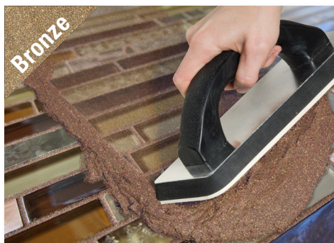
Ready-to-use, spreads easily