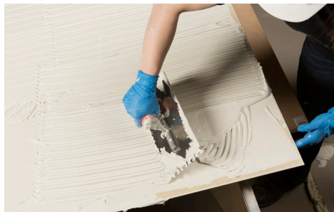
Ultra-Long Open Time

TotalFlex® 150 and 110 high-performance universal mortars combine maximum versatility with ultra-long open time and super-easy troweling. They are ideal for large heavy tile (LHT), gauged porcelain panels, thin-set applications, and uncoupling membranes. TotalFlex mortars provide new possibilities to improve tile installation efficiency, quality, and speed – all while enhancing safety with a reduced weight, silica-free* formula.