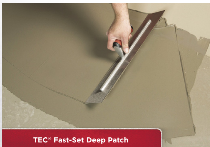
TEC® Fast-Set Deep Patch

* Registered trademark of Excello Corporation