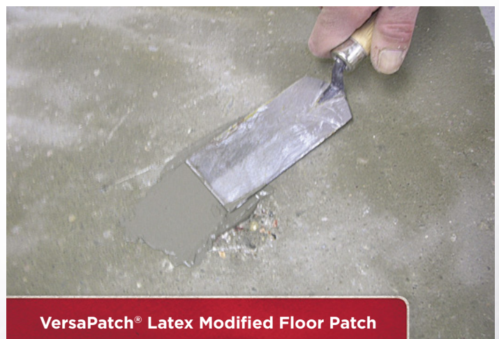
VersaPatch® Latex Modified Floor Patch