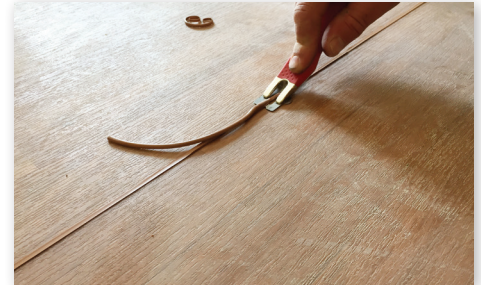
Heat weld as soon as 60 minutes

*Do not use with fiberglass-backed vinyl sheetgoods, nor directly over peel and stick tile. Not recommended for use with felt-backed or mineral-backed vinyl sheetgoods, linoleum or rubber. Refer to product data sheet or call the technical support line 800-832-9023 for an approved list of flooring.