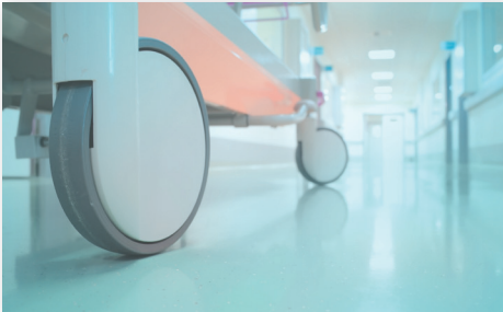
Ideal for LVT, LVP, VCT and solid vinyl heterogeneous or homogeneous sheetgoods*

TEC® TrowelFast™ Vinyl Flooring Adhesive is a breakthrough, user-friendly adhesive which is ideal for vinyl tile, vinyl plank, vinyl composition tile and solid vinyl sheetgoods*. This unique, low odor formulation dries quickly, has excellent resistance to moisture and alkali, provides a long open time and is easy to clean up. For details about TEC® product or system warranties, contact your sales associate or visit tecspecialty.com .