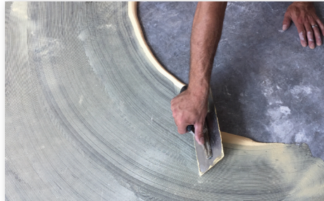
Fast drying, accepts flooring in 10-20 minutes