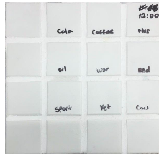
Stain Results for TEC® Power Grout® (Bright White) – Sample 3