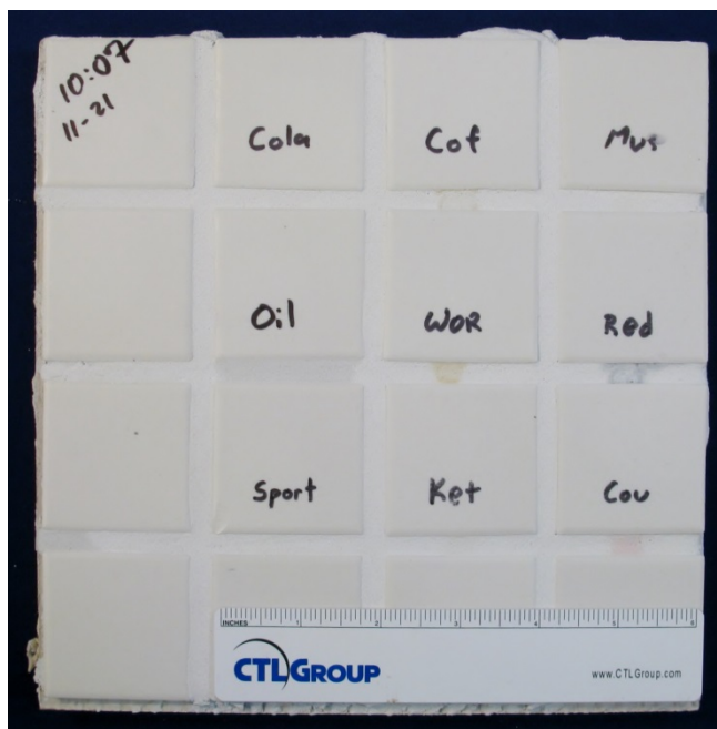
Stain Results for LATICRETE™ PERMACOLOR® Select (Bright White)