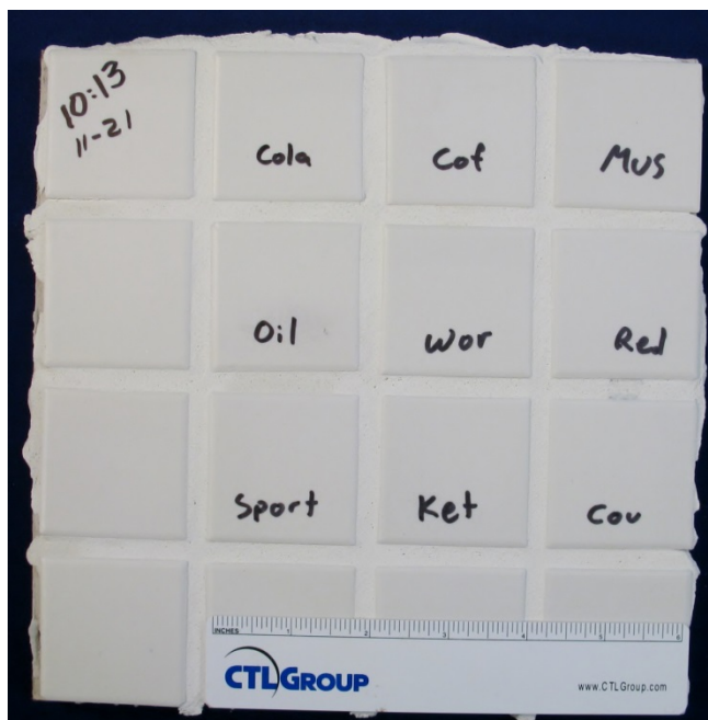
Stain Results for Mapei™ Ultracolor® Plus FA (Avalanche)