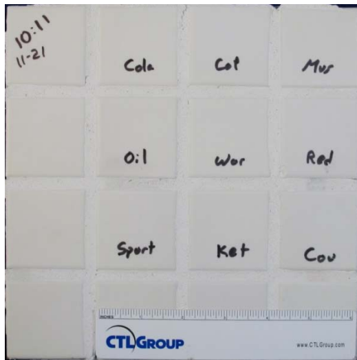
Stain Results for TEC® Power Grout® (Bright White) – Sample 1