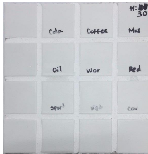
Stain Results for TEC® Power Grout® (Bright White) – Sample 2