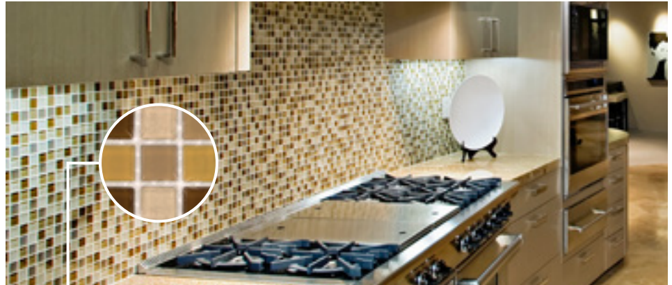
Design FX® Grout | Provides a Unique, Reflective Effect

Accentuates the beauty of glass, mosaic, metal tiles, ceramic, porcelain and most natural stone.